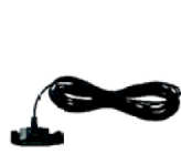
Push Button PTT