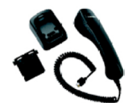
Telephone Style Handset Kit