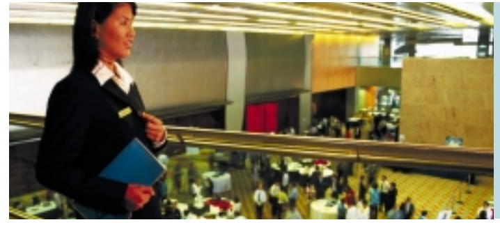
Event Coordination Mag One enables you with quick and clear communication. Helps you to get on with the job effectively and efficiently. It offers comfort for long period of usage.